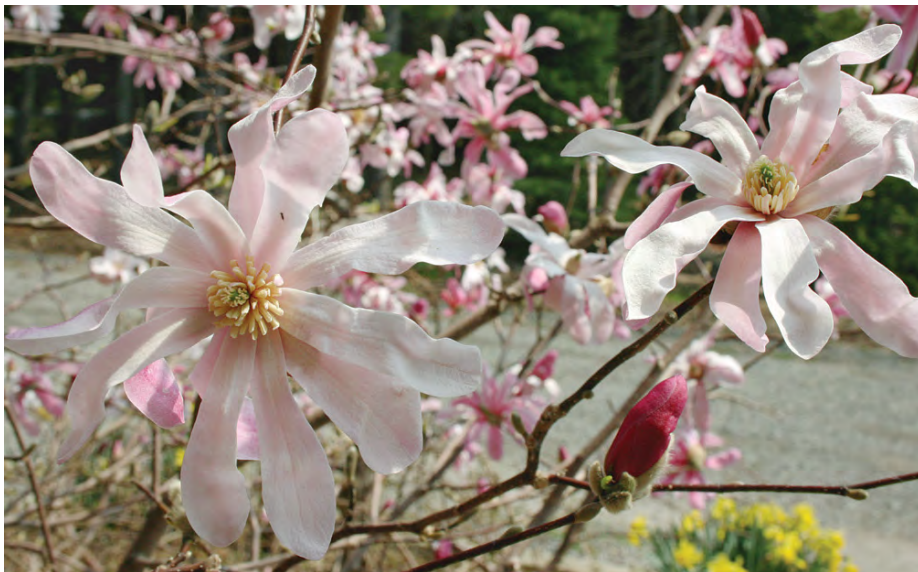
Magnolias in full bloom.