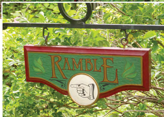
Sign points to a unique experience.