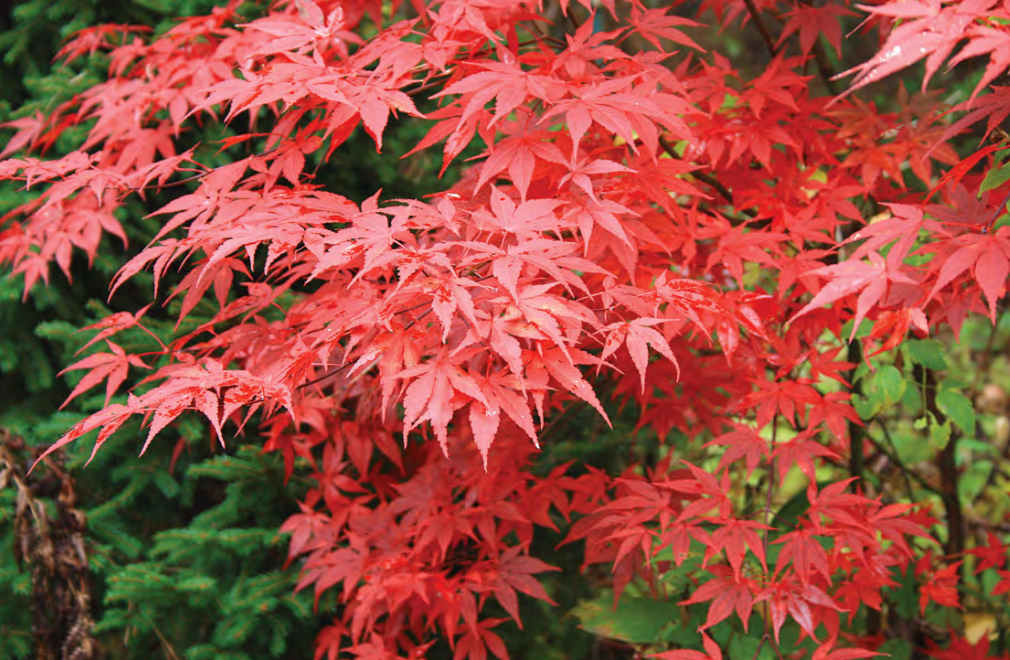
Experimentation with shade and acidic soil conditions led to a love of Japanese maple.