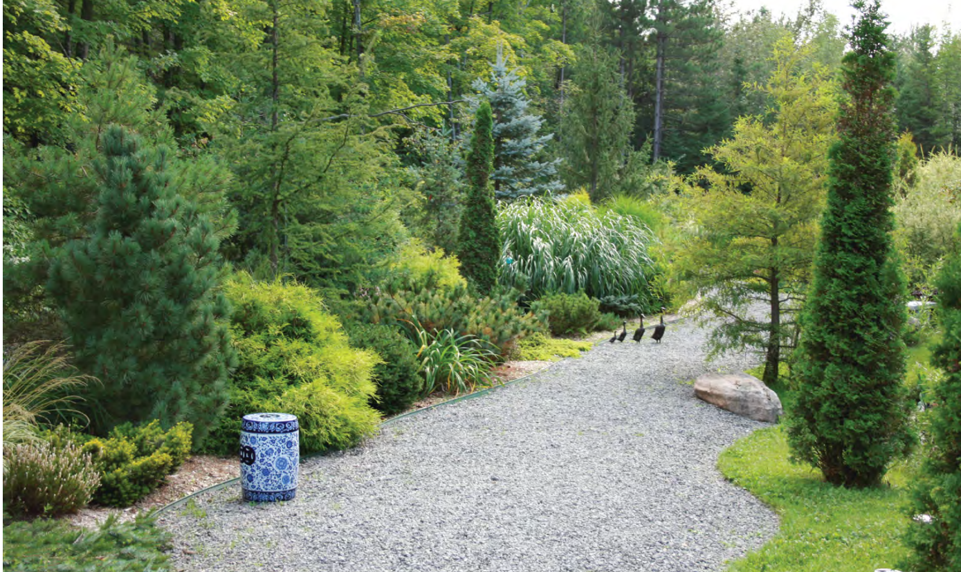
You can walk along one of many rambling pathways mapped out by Rob and Dave, and if you're inspired by what you see, you can likely buy it.