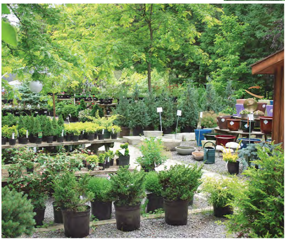
They stock about 300 different types of hostas and 100 kinds of rare conifers.