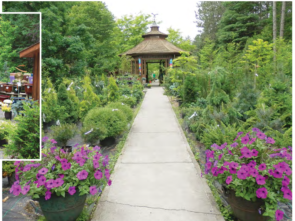
Many rare and exotic plant species have been gathered over the years.