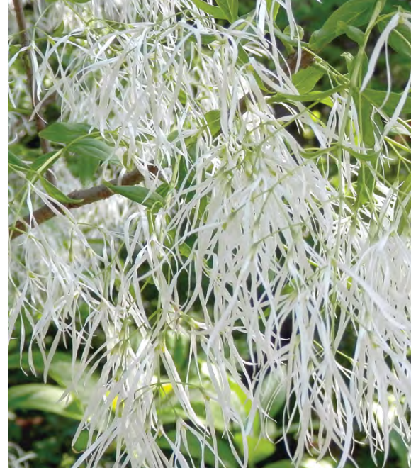
The beautiful and rare fringe tree.