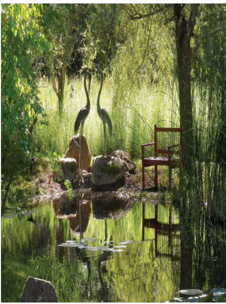
Peaceful beauty by a shaded pond.