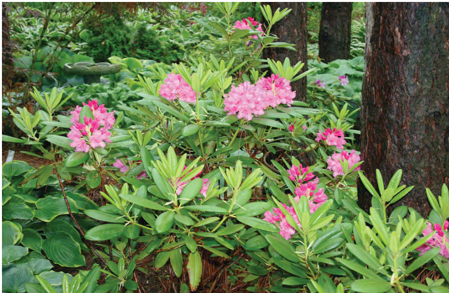
Rhododendrons also love acidic soil..