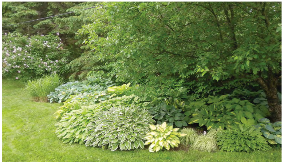
The most striking feature of hostas are the dramatic range of colour variation, and leaf type. They range through greens, blues, gold and variegated forms. With puckered, wrinkled, shiny, smooth or heavily veined leaves.