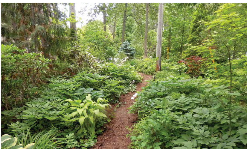
Smaller trails bring you closer to nature.

If you find yourself worrying, go outside, take three breaths, address a tree and quietly say, 'Thank you.' If you can't find a tree, a dandelion will do... nature is magic. — Robert Bateman