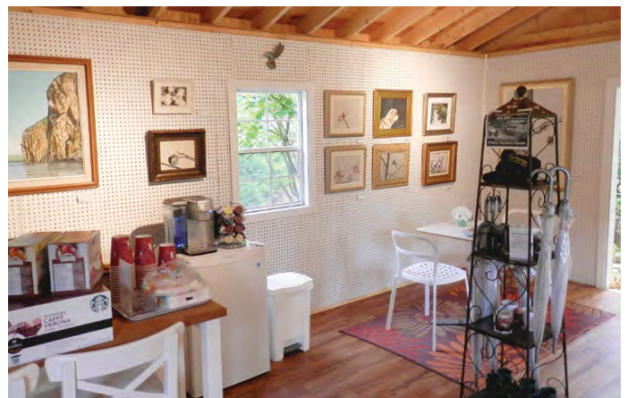
Dave's artwork is for sale and on display in The Pavilion.