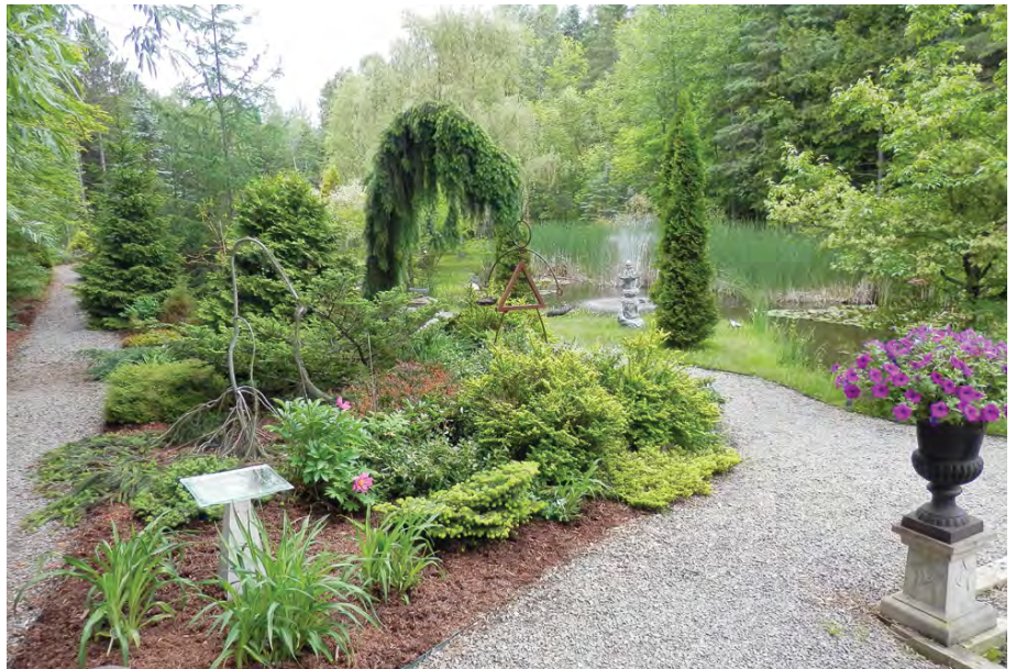
You can find a conifer to solve just about any problem and add beauty to any space..

The gardens and plantings have a definite character to them, almost a Tom Thompson style. Interesting specimens of conifers in every shape, colour, form and scale abound. Red tip Norway spruce sport a velvety red colour in spring, turning brown then green as the season progresses, while Max gold offers a contrasting canary yellow. Several of the specimens of