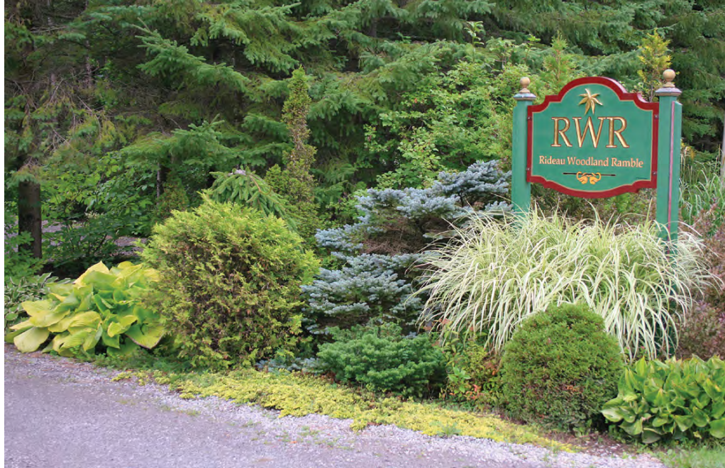
Situated south of Ottawa near the Rideau River, this plant nursery is nestled in the heart of a public garden.