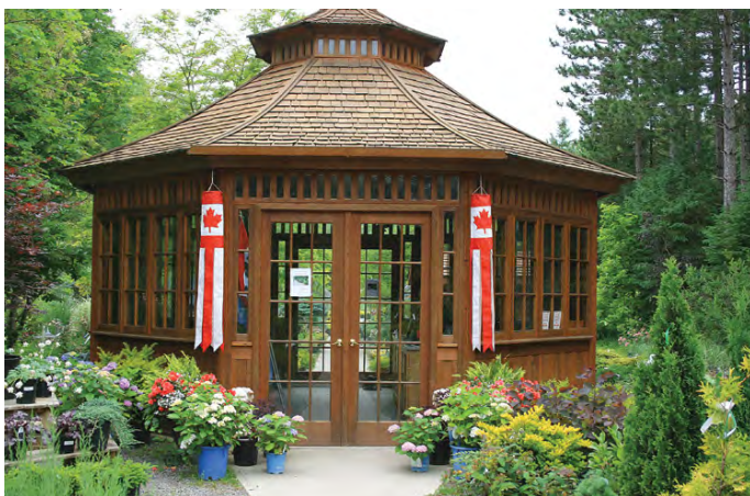
The garden centre is tucked away in the middle of the sanctuary.