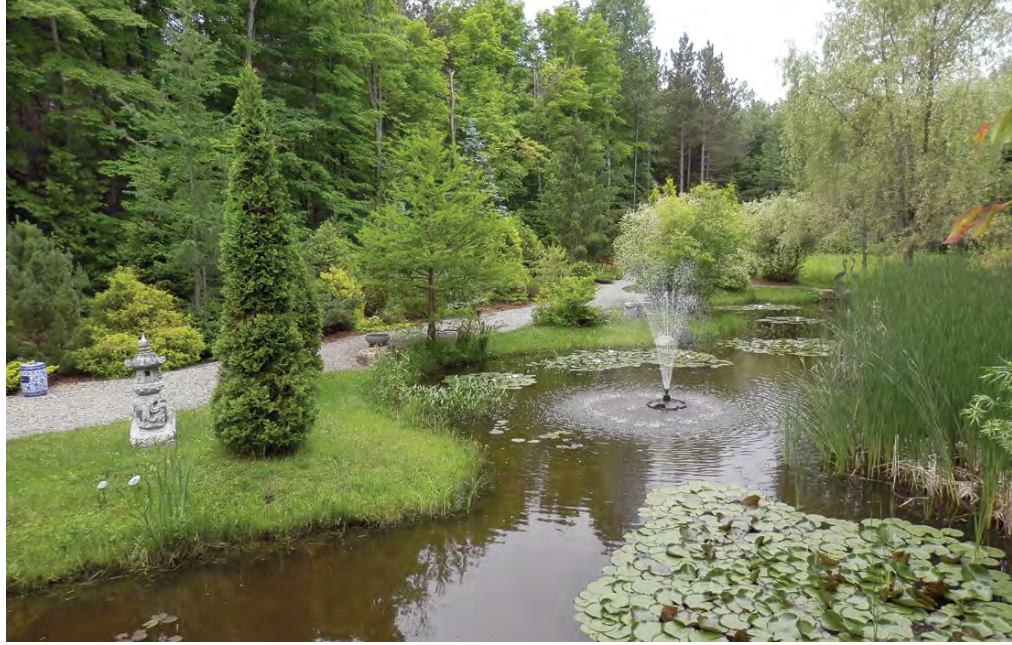
The pond area was borne from the destruction of the ice storm,

from all over eastern Ontario and even the Maritimes to wander through the seven acres. The woodland is filled with unusual gardens and lushly lined interconnected trails winding throughout their property. There has never been a charge to view the gardens, “that wasn’t the idea; to become a botanical garden,” says Dave.